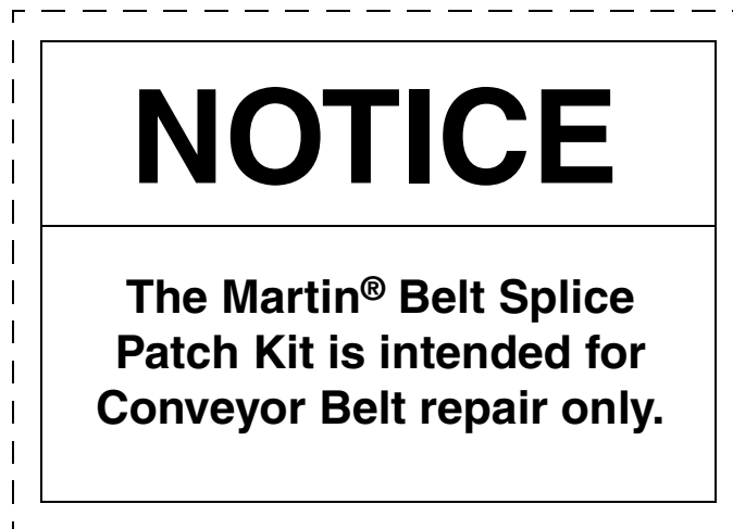
Martin® Belt Splice Patch Kit Intended Usage Label