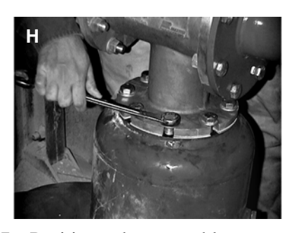
7. Position valve assembly over gasket and secure with fasteners (H). Tighten to snug.