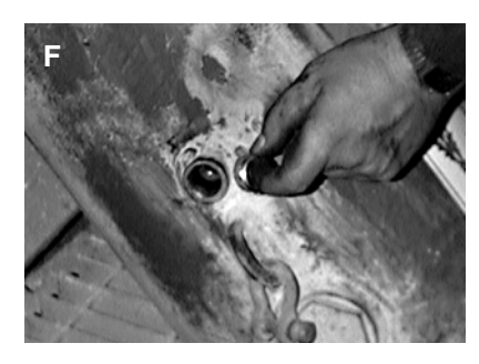
5. If necessary, plug current air inlet fitting on tank with supplied plug (F).